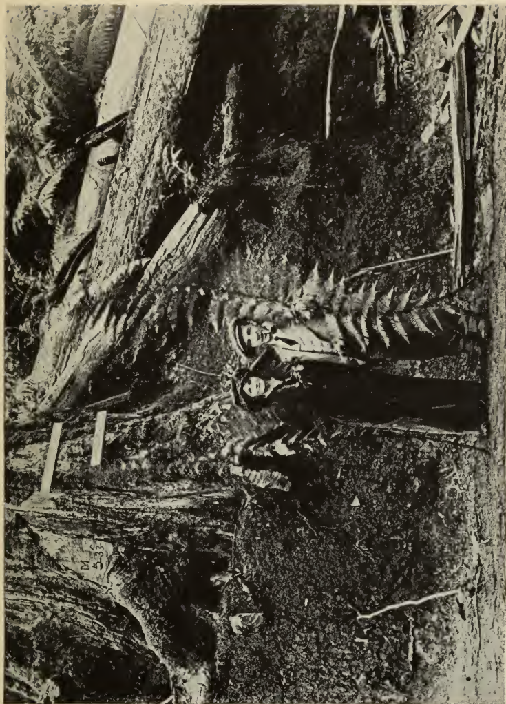
SIR HARRY AND LADY LAUDER IN FRONT OF AN ENORMOUS GUM TREE AT WARBURTON NEAR MELBOURNE